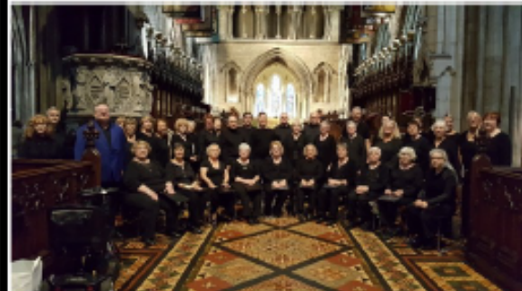
Celtic Encore Choir at St. Patrick's, Dublin