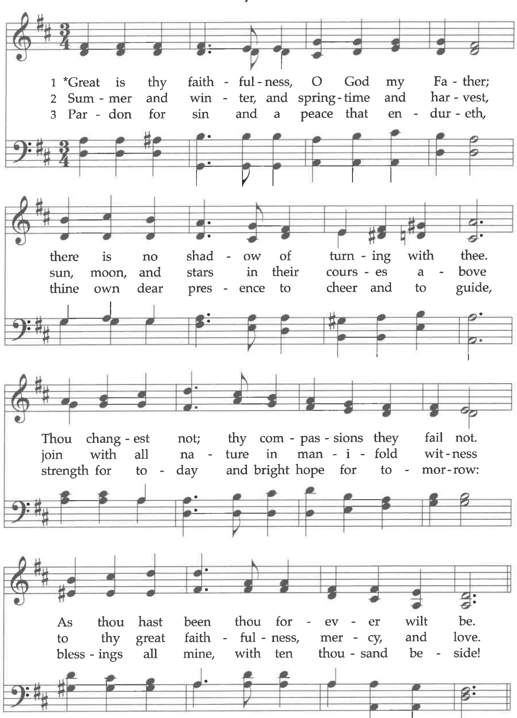
*Or "Great is thy faithfulness, O God, Creator."

Written as a meditation on Lamentations 3:22–23, this text is one of the few hymns among the 1200 poems by this Methodist writer and pastor that has gained much currency. The tune that appears here was composed especially for these words, and the pairing has proved enduring.