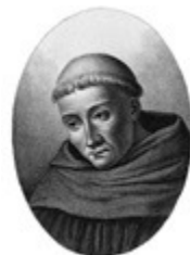
Bernard of Clairvaux

This hymn is taken from the 12 th century Latin poem "Jesu dulcis memoria" which has been attributed to the French Benedictine monk, Bernard of Clairvaux. There is much debate as to whether the hymns ascribed to