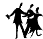
Greeters & Ushers