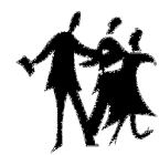
Greeters & Ushers